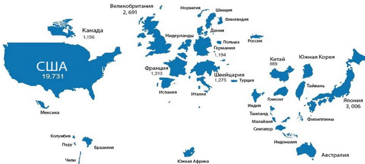
Figure 2. The world according to free-float equity market capitalization ($bn)