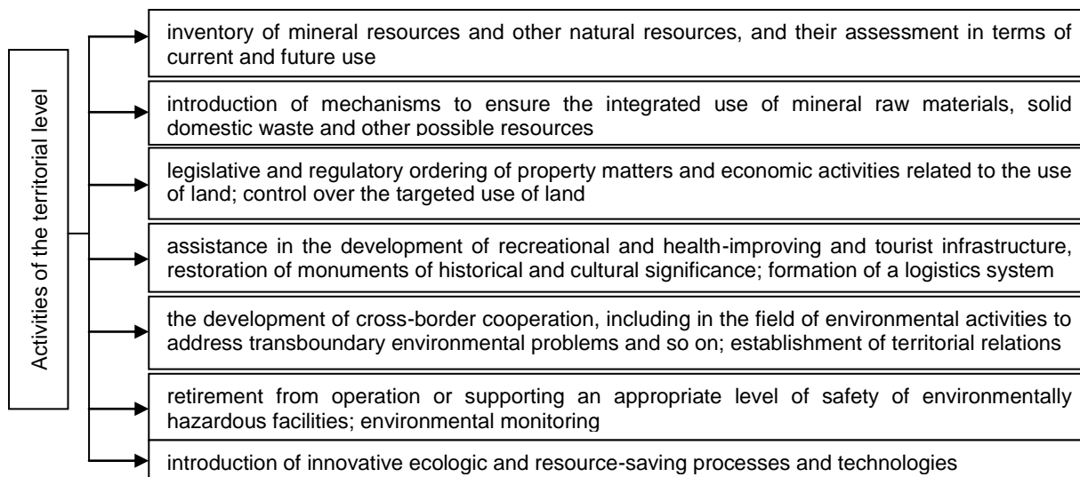
Fig. 1. Measures to ensure effective use of the available natural and resource potential at the territorial level

In order to ensure economically efficient use of the resources of territorial communities, the transformation of the existing potential into an effective factor of regional development, the territorial executive bodies need to focus on the implementation of, first of all, measures to ensure effective use of the existing natural and resource potential in the regions, the implementation of which will help to ensure its effective use. Proposed activities of the regional level are presented in the scheme (Fig. 1).